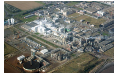
Laporte Road, Stallingborough Grimsby, North East Lincolnshire United Kingdom DN40 2PR